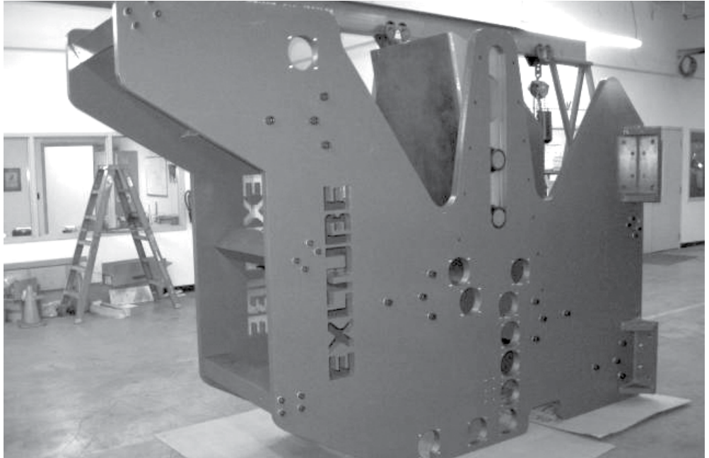
Above: Part of a straightening cell for EXL Tube constructed at K-Ter Imagineering..

The straightening cell is made up of three different pieces of equipment. K-Ter was responsible for the machining, assembly and painting of two of these