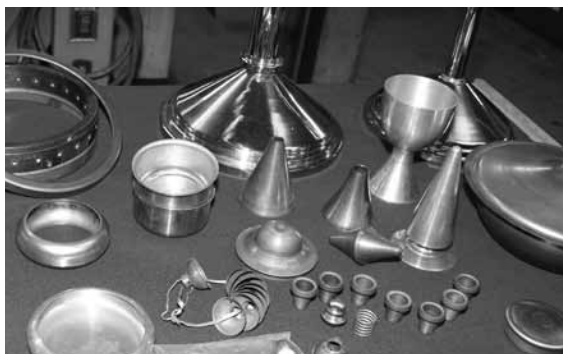
Above: Examples of spun parts produced at United Metal Spinning in KCMO.

In other chapter business, Ruco Products, Blue Springs, Missouri, was presented a new member plaque.