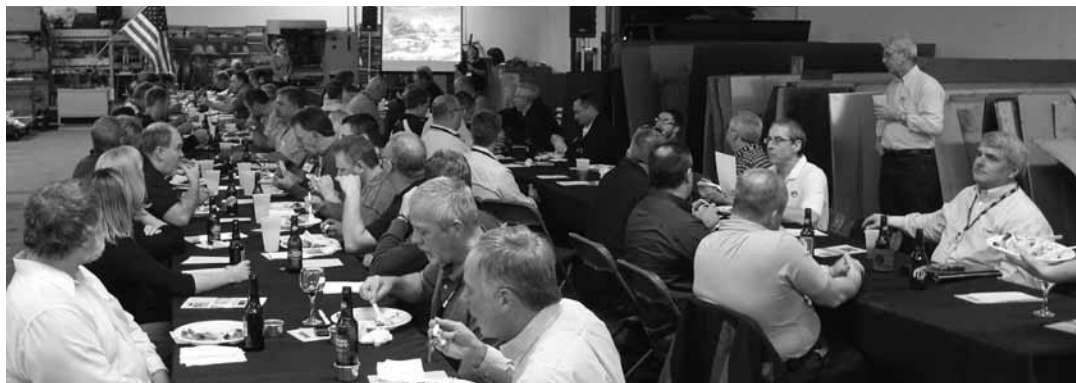
Above: Part of the crowd at the KC NTMA meeting at United Metal Spinning.