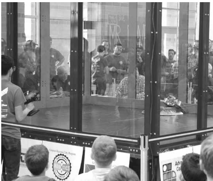
Above: Robots battling at the NTMA's NRL competition.

The Kansas City Chapter hosted it first National Robotic League (NRL) competition on March 28 th at Olathe Northwest High School.