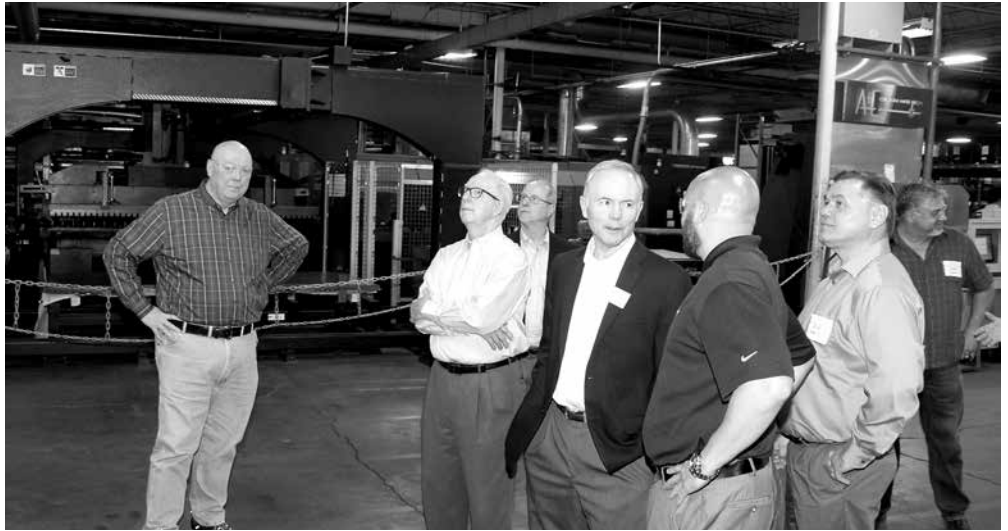
Above: KC NTMA members tour A&E Custom Mfg. Technologies.

A&E, a 55-year-old firm, offers a wide range of manufacturing services including: metal stamping; CNC turret punching; laser cutting; tooling & machining; metal fabrication; wire EDM; Mig & Tig & resistance welding; assembly and packaging.