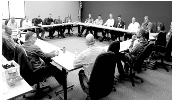
Above: Part of the attendees at the NTMA roundtable held at Hartwig-KC's facility on March 24th.

The Kansas City Chapter hosted an owner/principal roundtable at Hartwig-KC's facility on March 24th. Over 20 attended the event and discussed such topics as employee recruiting/retention, OSHA, EPA, health insurance and many other subjects.