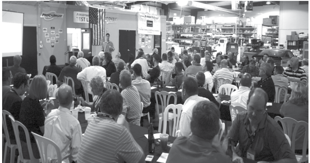
Above: Part of the crowd at the chapter's shop meeting at Accessible Technologies.

The KC NTMA chapter can be contacted at (816) 739-4422 or www.kentma.org .